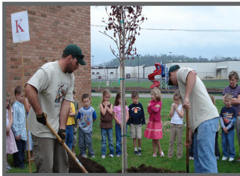
SCI REMC planting trees at Poston Road

For more information go to the SCI website at www.sciremc.coop and click on the Right of Way link under News & Information.